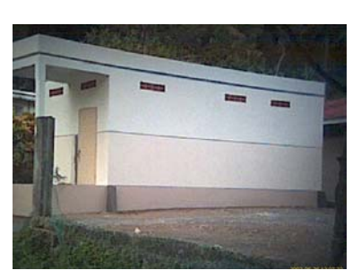
Castries SouthEast Satellite Warehouse

In April five persons from the communities participated in training in Shelter Management.