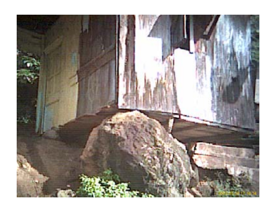
House at Soufriere

• 2003 National Emergency Management Advisory Committee (NEMAC) and the National Emergency Management Organisation (NEMO) Bi-Annual Meeting