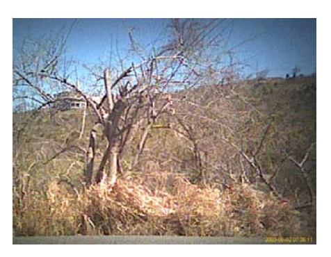
Dry Season in Dennery

Chairman – Dennery North Disaster Committee