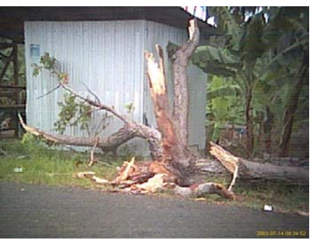
Downed Tree at Praslin July 7<sup>th</sup> Wave

Through NEMO and its other departments it is the intension of the Government of Saint Lucia to continue with the mandate of having the Nation prepared for a disaster.